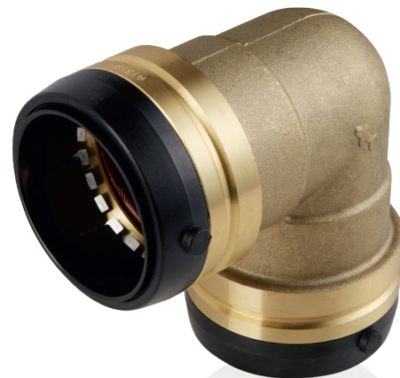
SharkBite 35mm - 54mm