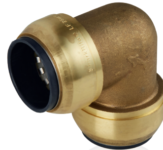
SharkBite 10mm - 28mm

Rigorous manufacturing and quality control, as well as long-term internal product testing, ensure the durability and seamless performance of the SharkBite Air & Pneumatics fittings.