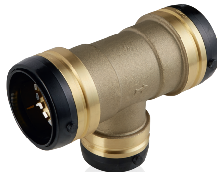
SharkBite 35mm - 54mm