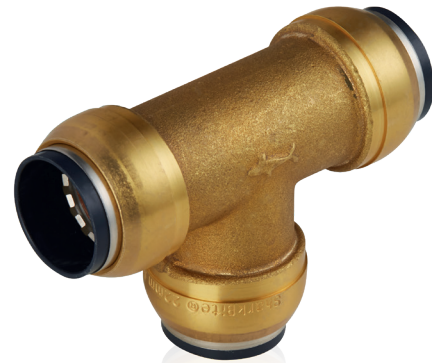
SharkBite 10mm - 28mm

Rigorous manufacturing and quality control, as well as long-term internal product testing, ensure the durability and seamless performance of the SharkBite Air & Pneumatics fittings.