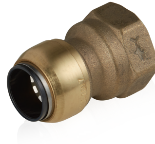
SharkBite 10mm - 28mm

Rigorous manufacturing and quality control, as well as long-term internal product testing, ensure the durability and seamless performance of the SharkBite Air & Pneumatics fittings.