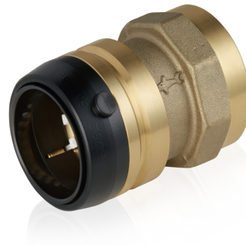
SharkBite 35mm - 54mm