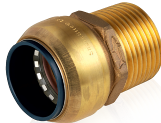
SharkBite 10mm - 28mm

Rigorous manufacturing and quality control, as well as long-term internal product testing, ensure the durability and seamless performance of the SharkBite Air & Pneumatics fittings.