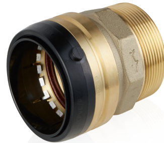
SharkBite 35mm - 54mm