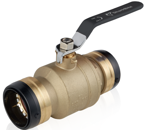
SharkBite 35mm - 54mm