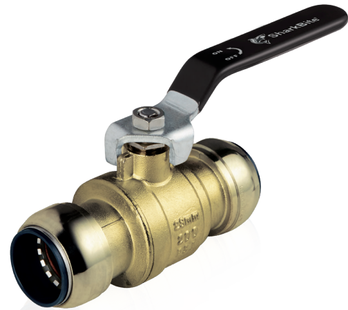
SharkBite 10mm - 28mm

Rigorous manufacturing and quality control, as well as long-term internal product testing, ensure the durability and seamless performance of the SharkBite Air & Pneumatics fittings.