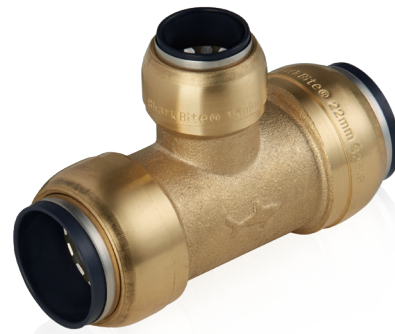
SharkBite 10mm - 28mm

Rigorous manufacturing and quality control, as well as long-term internal product testing, ensure the durability and seamless performance of the SharkBite Air & Pneumatics fittings.