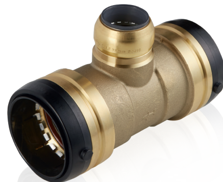
SharkBite 35mm - 54mm