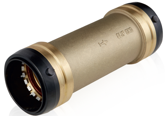
SharkBite 35mm - 54mm