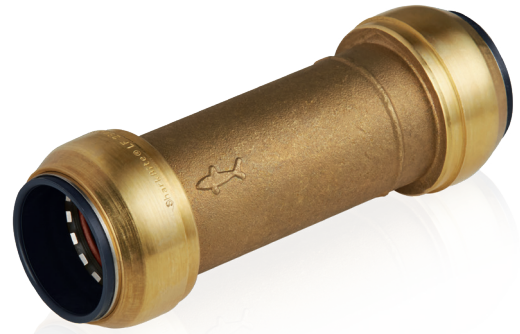
SharkBite 10mm - 28mm

Rigorous manufacturing and quality control, as well as long-term internal product testing, ensure the durability and seamless performance of the SharkBite Air & Pneumatics fittings.