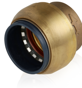
SharkBite 10mm - 28mm

Rigorous manufacturing and quality control, as well as long-term internal product testing, ensure the durability and seamless performance of the SharkBite Air & Pneumatics fittings.