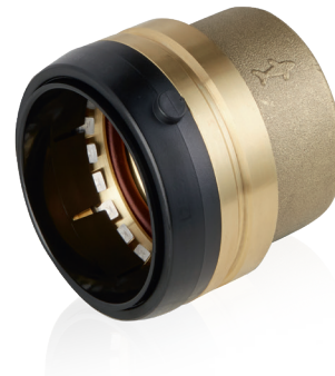
SharkBite 35mm - 54mm